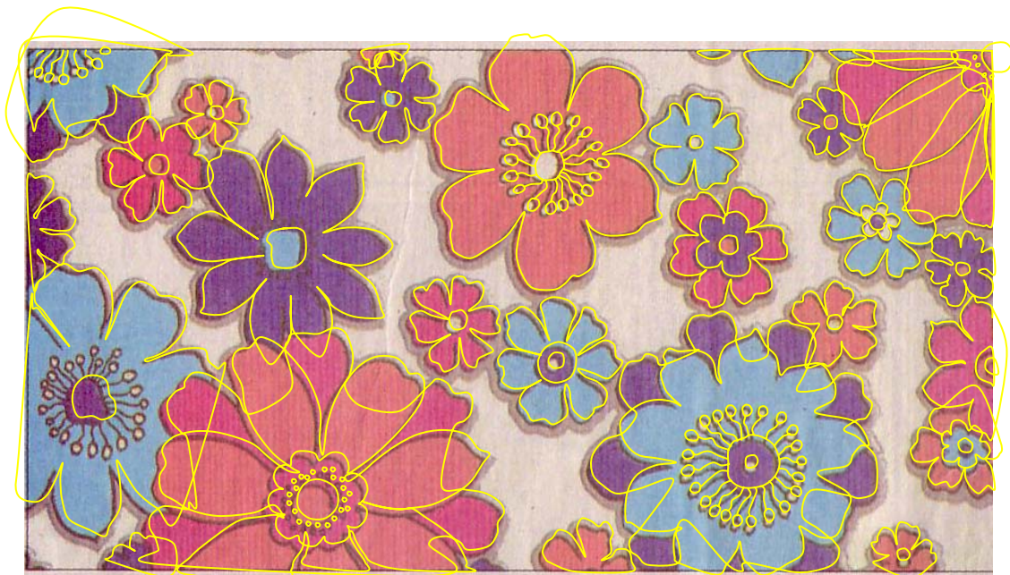
TRACE OVER SCAN USING AUTOSHAPES (LINES)